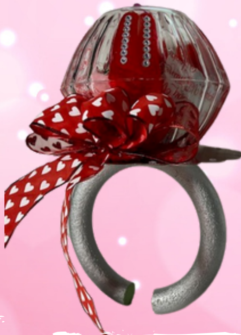
LIFE -SIZED CANDY FILLED RING POP $20.00