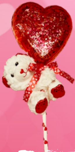
LARGE RED HEART CANDY FILLED LOLLIPOP $10.00

Scan the QR Code or Click the Link Below to Order