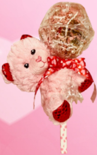
PINK CANDY FILLED LOLLIPOP $6.00