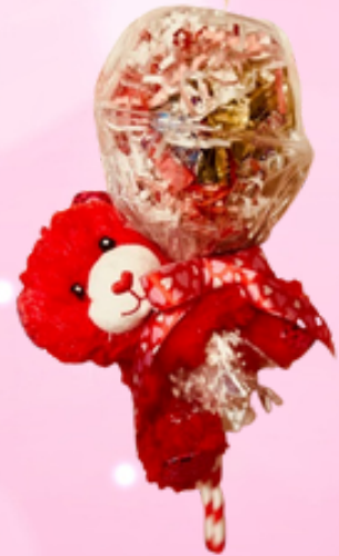
RED CANDY FILLED LOLLIPOP $6.00