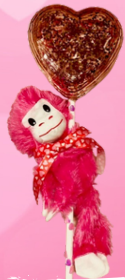
LARGE PINK HEART CANDY FILLED LOLLIPOP $10.00